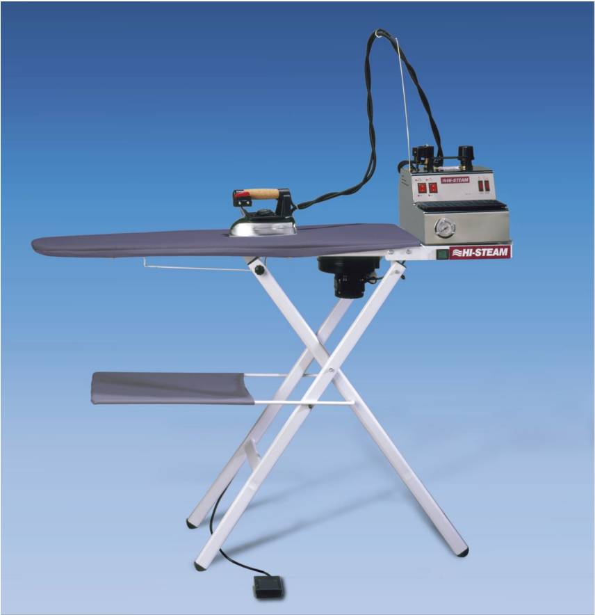
*Shown with optional Maxi-Steam SVP-24 Mini-Boiler + Iron